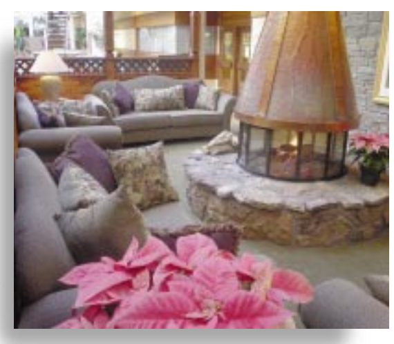
Fresh new looks abound throughout the commons

having been with us from the very beginning. There are many other potted plants in offices and retail areas and literally thousands of outdoor and hanging plants that we continually treasure and care for. Keeping our plant family healthy is a big job.